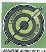
LASSWADE ARCHERY CLUB

As with last year we have copies of the latest catalogues for Archery World, Bow Sports and Quicks. All of them have a "Club Copy Only" label on them. So while you are welcome to look through them please remember they should not be removed from the club as they also help our coaches to advise newer members on what equipment they may eventually require. If you require a copy of your own then you can contact the appropriate company. We also have a copy of the GNAS Rules of Shooting for any of you who are so inclined! The above items are kept in the drawer of the green cabinet.