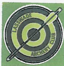
LASSWADE ARCHERY CLUB

So this item is by way of a premature goodbye and she will hopefully return some time in the future.